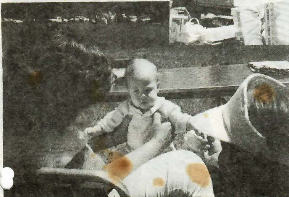
Now, this is a Great Purchase!